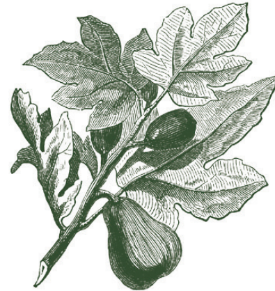
FIG GARDEN HOME OWNERS ASSOCIATION OFFICERS & DIRECTORS FOR 2024

Have a wonderful 2024. Stay safe and be well!