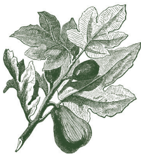
FIG · GARDEN HOME · OWNERS ASSOCIATION