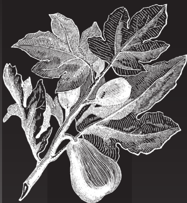
FIG · GARDEN HOME · OWNERS ASSOCIATION