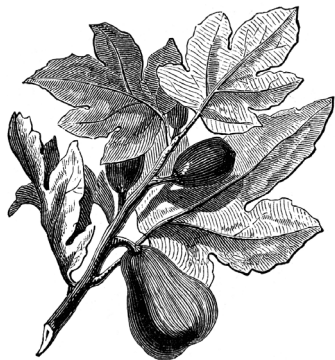
FIG · GARDEN HOME · OWNERS ASSOCIATION